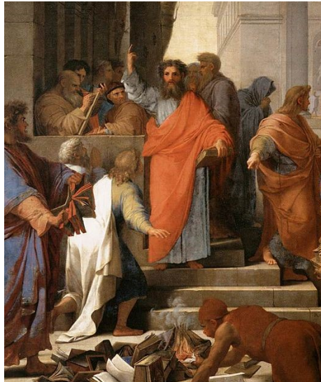
The Preaching of Saint Paul at Ephesus by Le Sueur

And to be a sin would mean there’s a refusal to believe, not just questioning. Questioning means, “Hmm... I don’t know why women can’t become priests. I accept it, but don’t know why.”